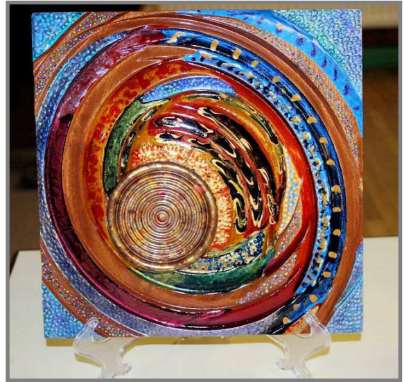
Second - Hugh Field